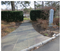
#200 The Japanese Garden in Delaware Park