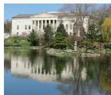
#205 The Buffalo History Museum