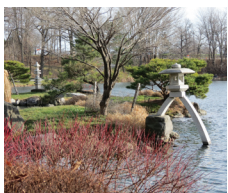
#203 The Three Islands