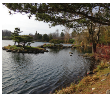
#204 Olmsted and the Japanese Empire