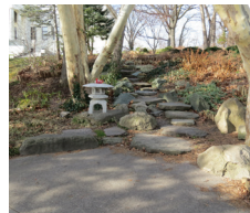
#202 Path of the Imagination