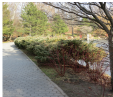
#201 The Strolling Garden in Delaware Park