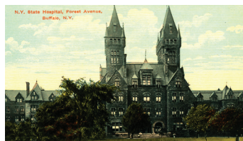
#309 The Richardson Olmsted Complex