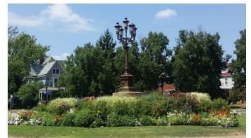
#307 Ferry Circle / Richmond Avenue