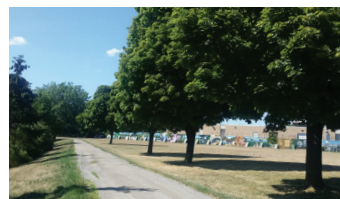
#310 Scajaquada Creek / Jesse Kregal Pathway