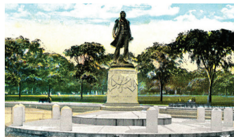
#301 Perry Monument (War of 1812)