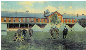
#300 Fort Porter

#310 Scajaquada Creek / Jesse Kregal Pathway