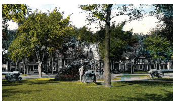
#308 Colonial Circle / Richmond Avenue