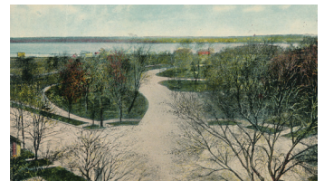
#303 Front Park Entrance