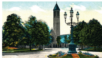
#305 The Circle (now Symphony Circle)