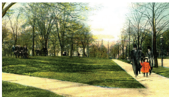
#304 Prospect Hill Parks (Prospect & Columbus)