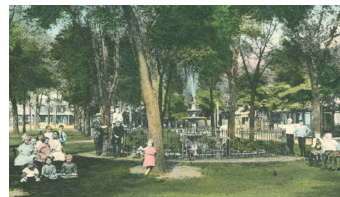
#306 Days Park