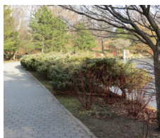
#201 The Strolling Garden in Delaware Park