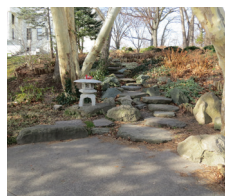
#202 Path of the Imagination