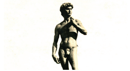
#102 The Statue of David