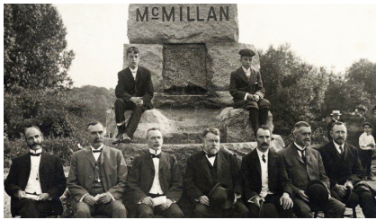
#103 The McMillan Monument