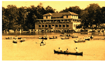
#104 The Marcy Casino