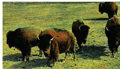
#114 The Zoo Paddock