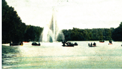
#101 Gala Water (now Hoyt Lake)