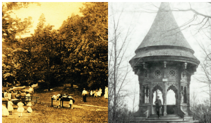
#106 Beach Banks Picnic Grounds & Spire Head House