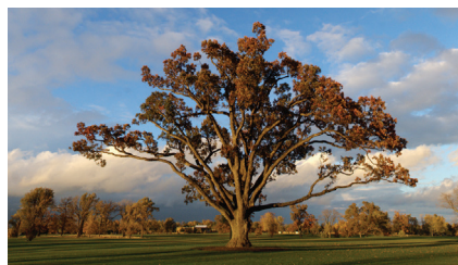
#111 The Mighty Oak in the Meadow