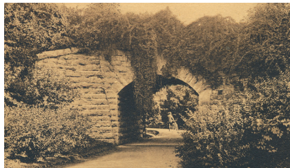
#107 The Ivy Bridge