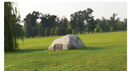
#112 Flint Hill Memorial