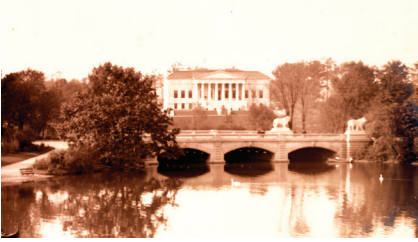
#100 Bridge of the Three Americas