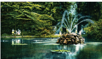
#113 Delaware Park Lily Pond