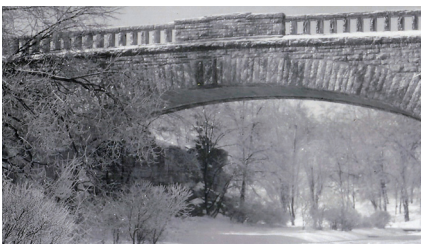
#110 The Quarry Garden