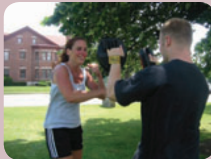
DP Fitness Camp runs T, TH, SA at 12:30pm through December. Join today!

Please stay tuned for more programs coming in 2010 or call 716-280-8126.