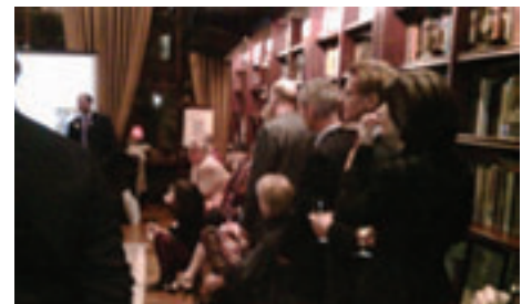
BIG APPLE FUNDRAISER - Sept. 29, 2009