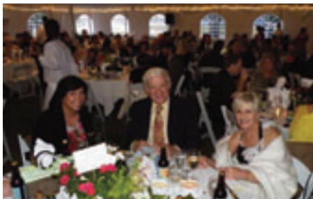
FLO GALA - July 17, 2009