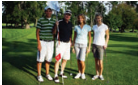
OLMSTED OPEN JUNIOR CHALLENGE August 22, 2009